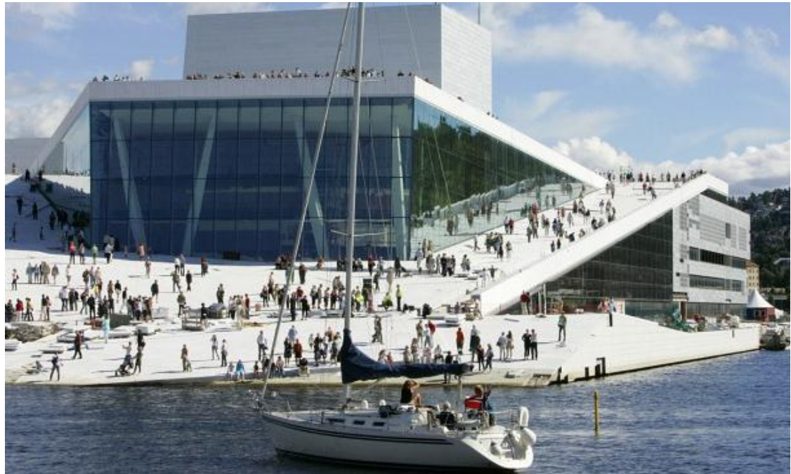
The Opera in Oslo Snøhetta, 2008