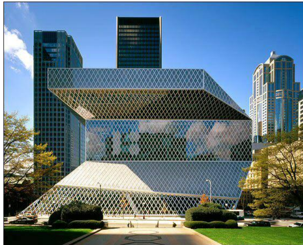
Seattle Central Library Rem Koolhaas, 2004