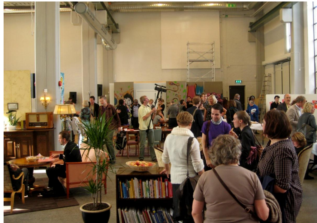
The Garage, Malmö, 2008