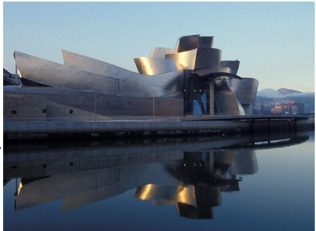
New Guggenheim in Bilbao, Frank Gehry, 1997