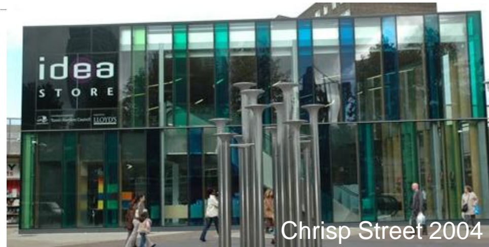
Crisp Street 2004