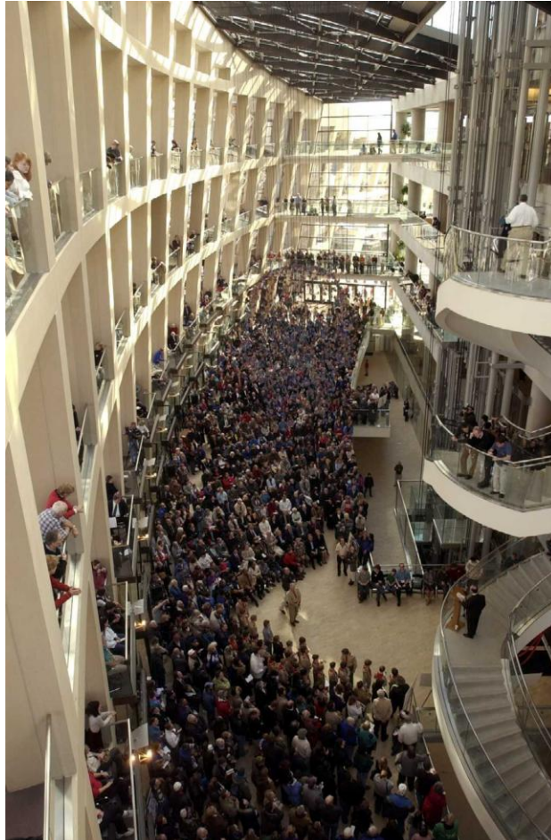
Salt Lake City Main Library Moshe Safdi, 2003

Revitalisation of former industrial areas